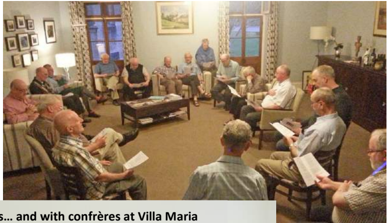
Combined Oz & NZ Councils... and with confrères at Villa Maria