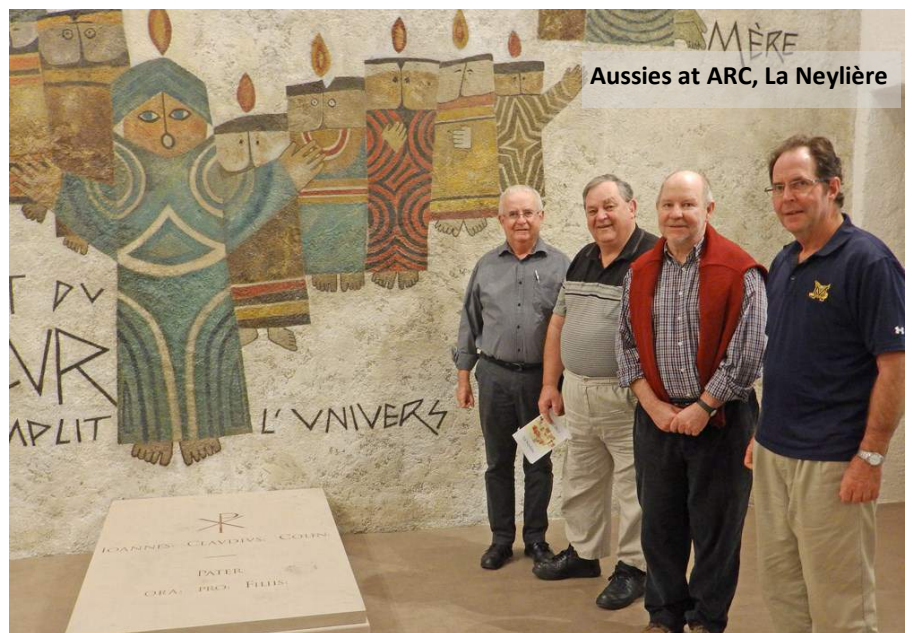
Aussies at ARC, La Neylière